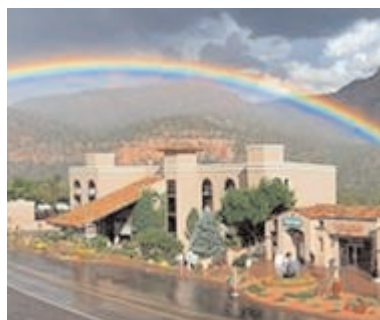
400 North Highway 89A, Sedona AZ 86336 * 800.773.3662 • 928.282.4001