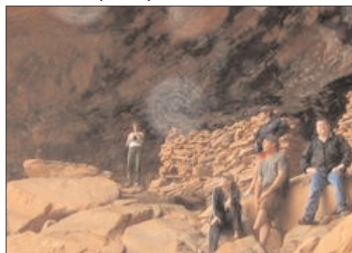
Initiation on the Throne of Consciousness; Orbs in Boynton Canyon